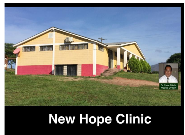
New Hope Clinic

The people in all the communities are very pleased with the news that next